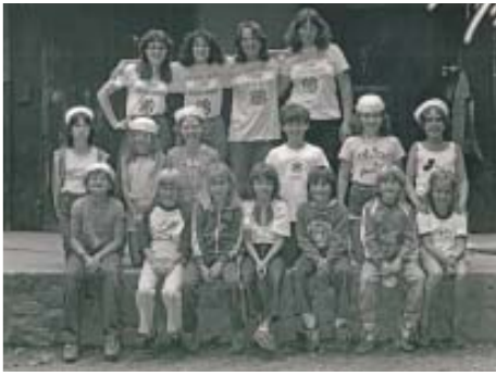
4-H Prep Camp at Stokes, c. 1980.