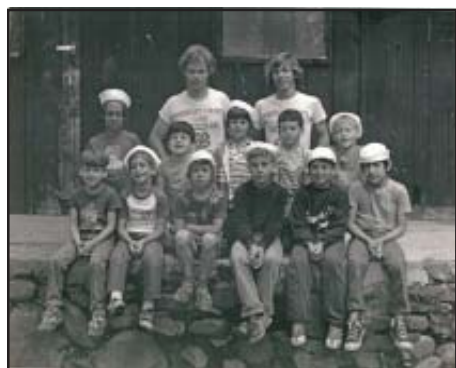
4-H Prep Camp at Stokes, c. 1980.

4-H programs are conducted in 3,150 counties and territories of the United States. There are 4-H-type programs in 82 countries around the world, involving approximately 4.5 million youth. 4-H Alumni now total more than 50 million. ■